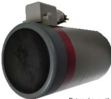
Picture shown with optional right angle connector.

The Imagenex Model 881A Echo Sounder is a completely self-contained echo sounder with a serial output. It is mounted in a pressure-proof housing with an underwater connector for use in depths up to 3000 meters (10000 feet). It can be used as a standard echo sounder or with digitized first returns only. Its requirements are minimal, needing only a power source and a digital interface to an external device such as a personal or laptop computer.